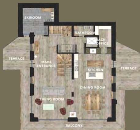
MASO 1st FLOOR 187 sq.m Living Skiroom Kitchen Dining Room