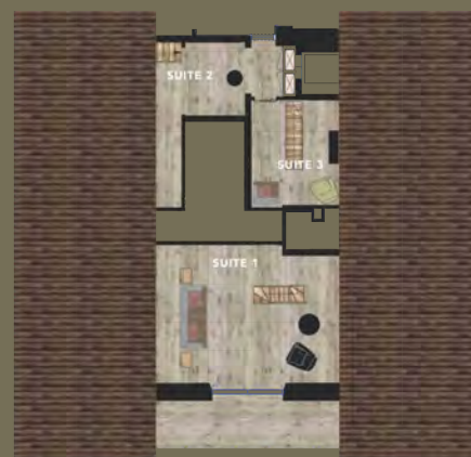
MASO MEZZANINES 63 sq.m Mezzanine Suite 1 Mezzanine Suite 2 Mezzanine Suite 3