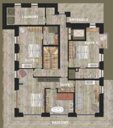
MASO 2nd FLOOR 170 sq.m Suite 1 (5+1 Guests) Suite 2 (2 Guests) Suite 3 (2+1 Guests) Laundry